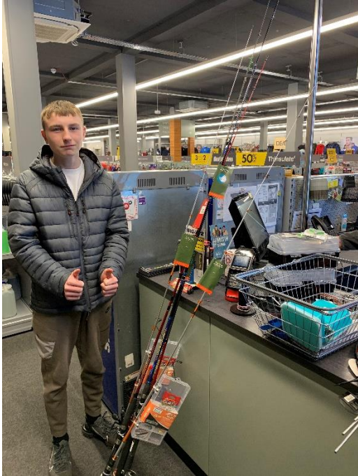
FISHING IN PRUDHOE