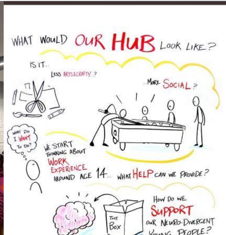
Young people hard at work enjoying themselves and understanding the possibilities!